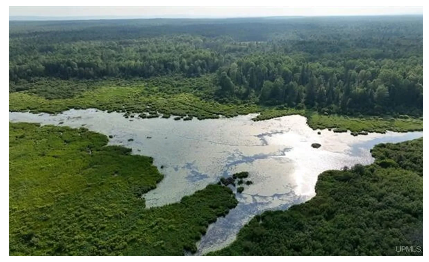
$110,000 110± Acres Ontonagon County