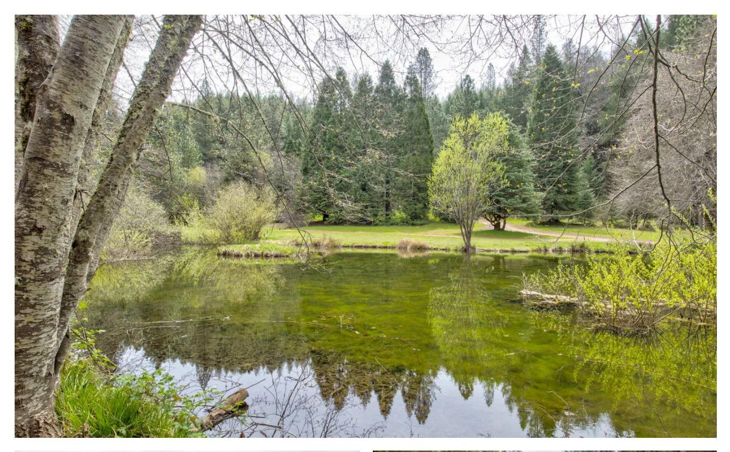
$2,650,000 217± Acres Calaveras County