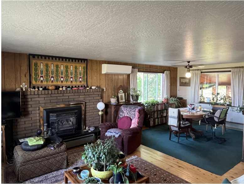
Beautiful knotty pine flooring in living and dining rooms