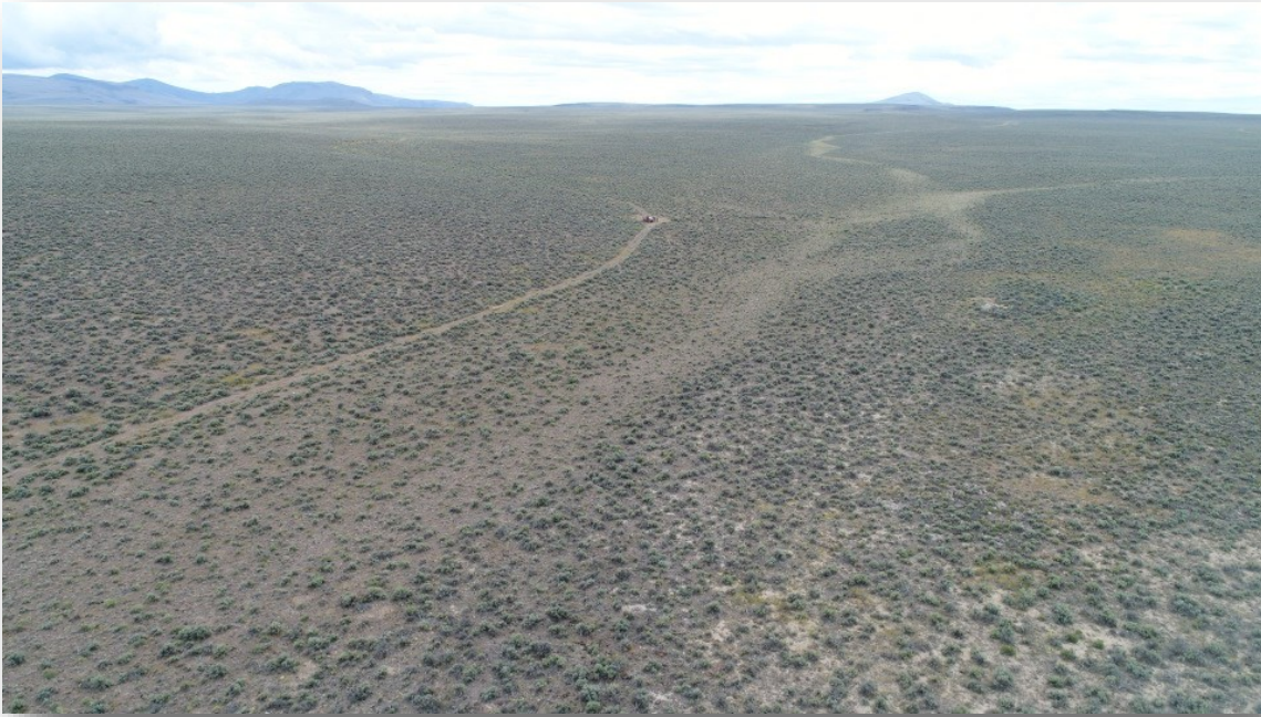
Looking south, Lone Grave Butte in the background